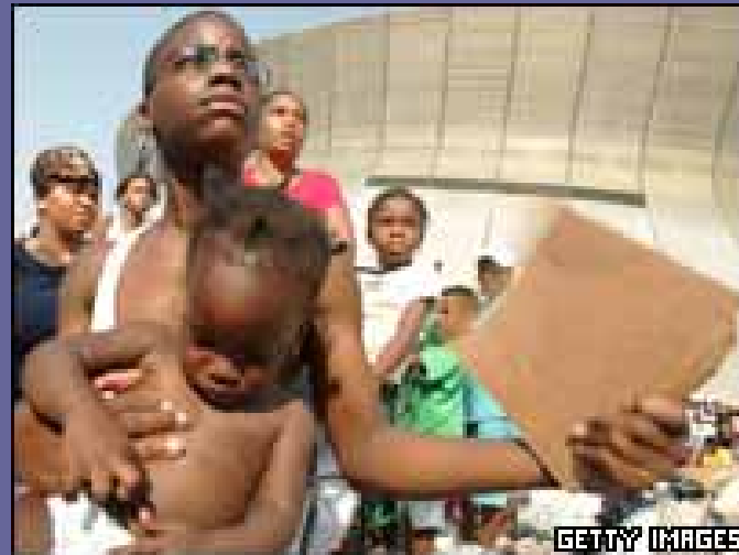
Hurricane: New Orleans