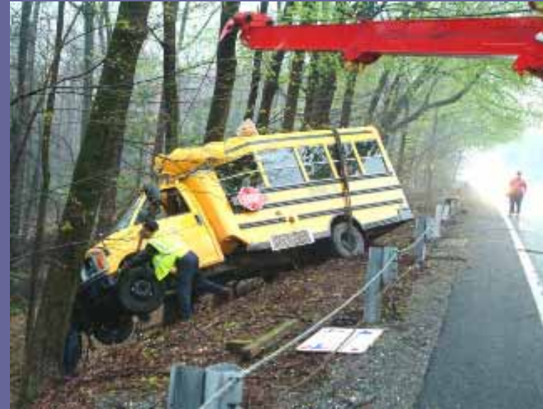
Major Accident: USA