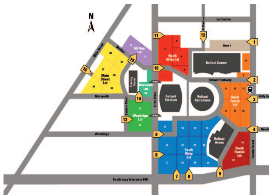
FIGURE 1 A diagram of the Reliant Park facilities, where evacuees were housed. The Reliant Arena is where the Katrina clinic was situated.

While city and county plans were being finalized and the Reliant Park facilities were being prepared for what