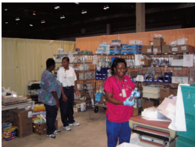
FIGURE 2 The MPERT pharmacy that was created, stocked, and staffed entirely by TCH.

After medication dispensing was initiated, the need for an expanded formulary was recognized, and medications were ordered and delivered by TCH pharmacy staff. An initial discussion was held, and a list of medications appropriate for the types of patients and illnesses being treated was compiled. Medications for chronic illnesses (primarily respiratory) and topical medications for patients who had waded in polluted water were those needed most critically. Several considerations were made when choosing the medications that would be included on the “formulary.” Because families sheltered in the Astrodome did not have access to refrigerators, measuring systems, or adequate storage for their